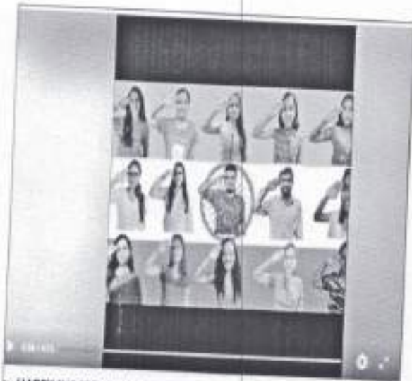
IN HAPPY INDEPENDENCE DAY • Video making competition • Video from 3 rd year