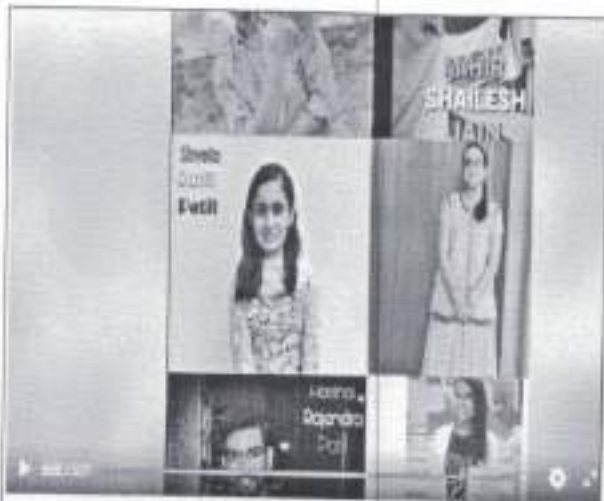
INHAPPY INDEPENDENCE DAYIN -Video making competition * Video from 1st year