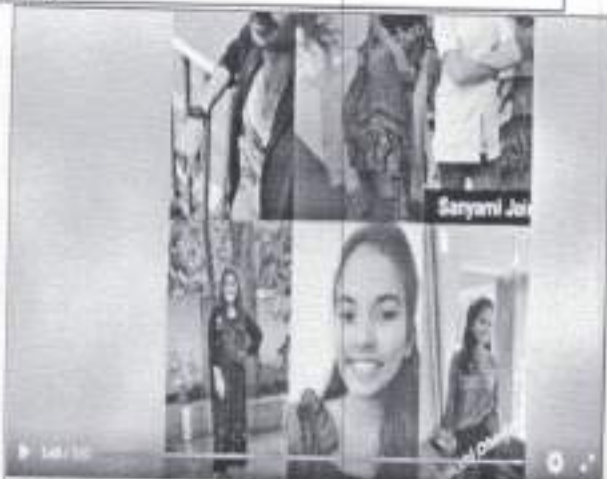
INHAPPY INDEPENDENCE DAYIN -Video making competition * Video from 1st year