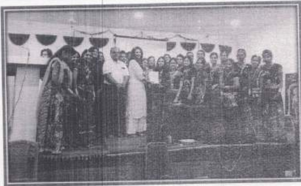
Prize distribution Dandia Night