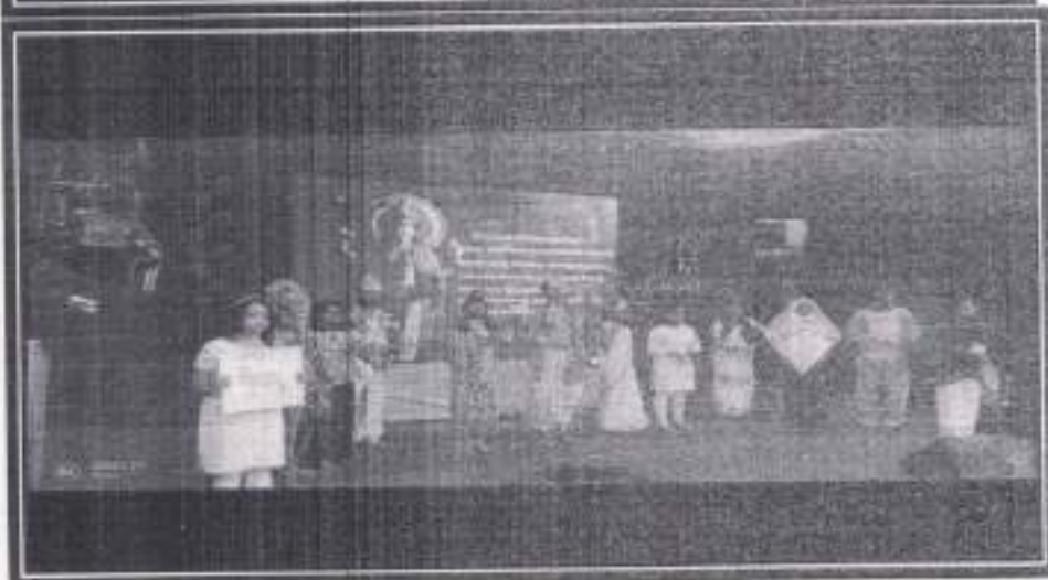
Samudra Manthan act played by students .